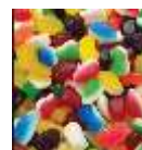
Chocolate and Lollies