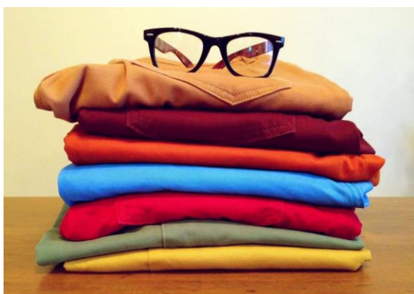
Interested in reviewing the school uniform? Calling students Years 6-8!

If your child is interested in participating in one or more of these ensembles, please ask Mr Home for an application form, and bring the completed form to rehearsal.